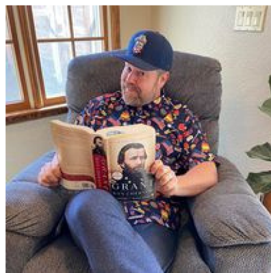
Teddy Roosevelt, US Grant, Ron Swanson. #murica'