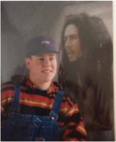
Award winning senior portrait Go class of '93

Born in Fountain Valley, but raised in Sacramento I began my college career in the Los Rios system as a very confused and lost student. It only made sense that I would come back to Los Rios as the Dean of Arts, Media and Entertainment after a lengthy stay in Fullerton for my degrees, a stint in Chicago followed by a decade or so in San Diego where I met my wife.