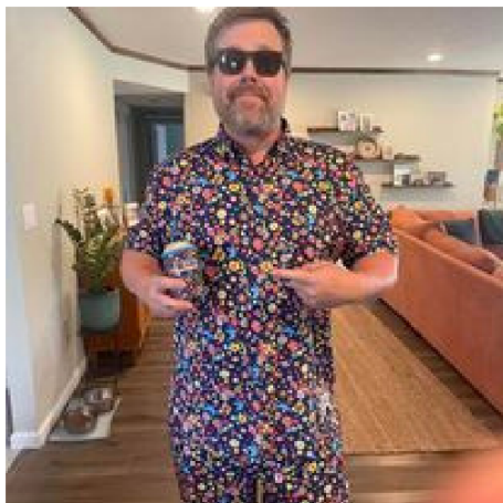
Everyone needs a RSVLTS tuxedo