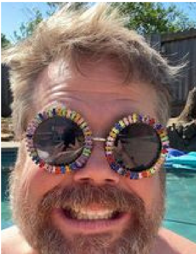
Have Pride in your eyewear

Supporting oneself as an Actor means that I waited a LOT of tables and had a LOT of admin jobs. Doing so meant I had a very good management skill set once I got to my career in academia. Being an artist who is good at the "business stuff" has served me very well in my life and career and is something I try to impart to all young artists. Know your worth. Know how to do other stuff. Don't lock yourself down in one part of the art. I loved teaching, but I absolutely love being the first ever arts trained Dean in a Division that has needed someone who understands the artist voice for decades. I'm proud of the work we are doing!