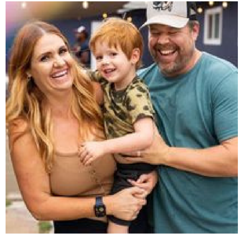
What are we without laughter?

I am so glad to be a part of the 2023 Great Deans program. I've dabbled at the edge of the organization for a couple of years and am very much looking forward to connecting with all of you!