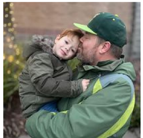
My favorite person next to...