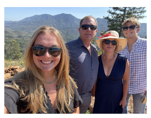
My family - a few weeks ago at a local wedding with close friends