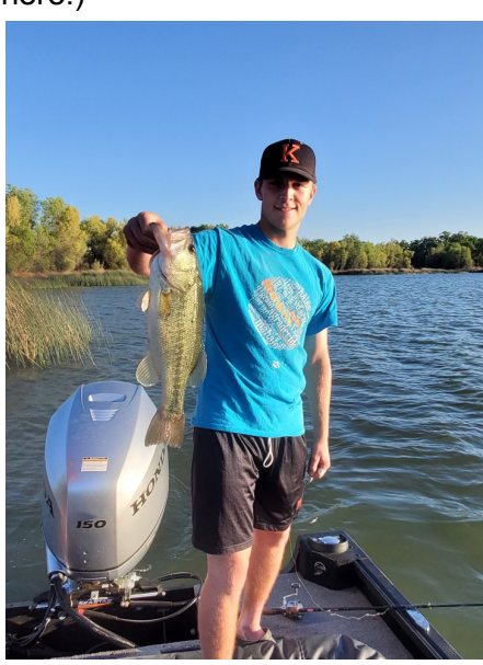
My son, fishing on Clearlake (popular to Bass fisherman)