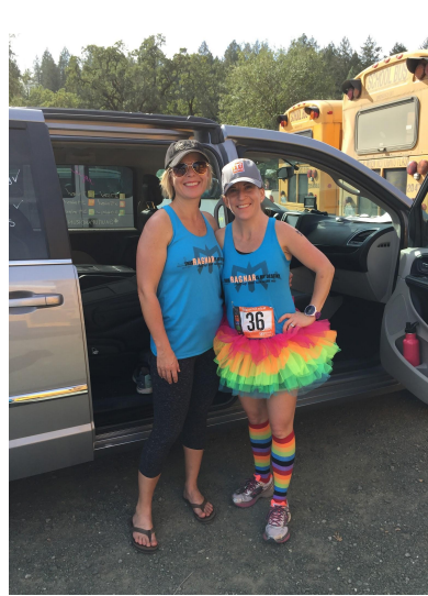
My sister & I (running relay)