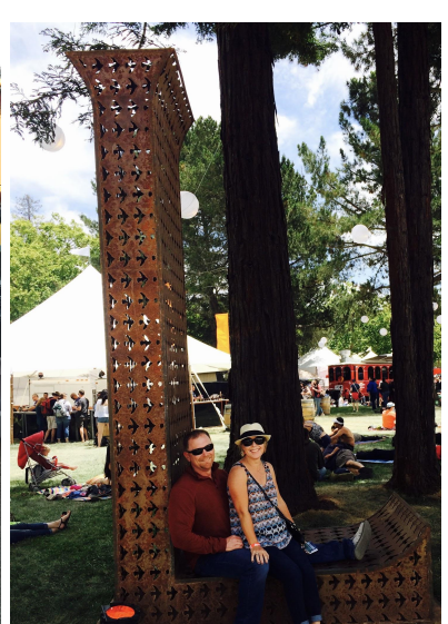
My husband & I

When I met my husband (who is a high school Chemistry teacher and coach), we settled into the town we were both raised, Kelseyville, Ca. We decided to build our own home, and this is a great source of pride and accomplishment for us as a family. We enjoy the 'do it yourself' projects. He also exposed me to the more 'country' parts about living in Lake County. He also coaching high school sports and that is very much part of our identity as a couple. Both of my children were very involved in athletics and clubs. As such, I found myself volunteering to be a